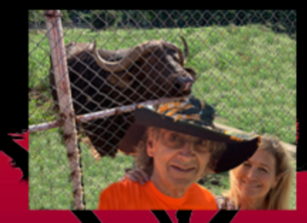
A visit to Kisumu Impala Sanctuary fronting Lake Victoria, NO mr. buffalo, I'm not lunch!