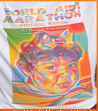
World AIDS Marathon t-shirt

for being a 'Racing to Save Lives Volunteer' for the 2021 World AIDS Marathon and its related Events. 897 orphans dined & danced + 205 orphans were examined and treated by doctors at 4 orphan dinner dances, + 2 days for art lessons/exhibit and concert for special needs kids in conjunction with the 15th annual World AIDS Marathon on World AIDS Day in Kisumu, Kenya. 100 runners participated in the full + half Marathon + 5K relay run. According to UNICEF, 1 Kenyan child in 24 will die before their 5th birthday. Thank you to the doctors for saving the lives of many Kenyan orphans + International & Kenyan runners, sponsors, volunteers, singers & dancers, and art tutors.